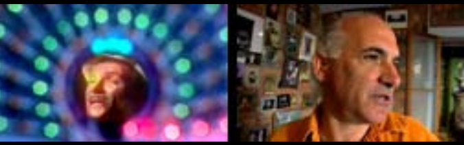
SHADDAP ALREADY – AN INTERVIEW WITH THE FAMED JOE DOLCE, TWENTY-FIVE YEARS AFTER HE LAUNCHED THE WORLD'S BIGGEST SELLING SINGLE.