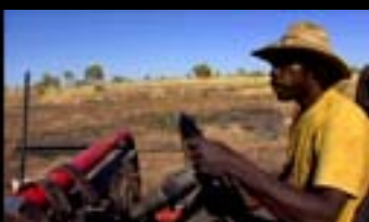
BULL BUGGIES – INTRODUCES THE PRACTICAL, YET FANTASTICAL, 'BULL BUGGY' USED BY AN ABORIGINAL STATION MANAGER TO HELP WITH HIS JOB.