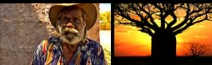
THE BOAB STORY – FACTS ABOUT THE BOAB TREES THAT SIT LIKE ANCIENT MONOLITHS AMIDST THE HARSH KIMBERLEY TERRAIN OF NORTHWEST AUSTRALIA.