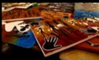
KIMBERLEY ROCK ART – A LOCAL VIEW ON THE DISTINCTIVE STYLES OF ANCIENT ROCK ART KNOWN AS THE BRADSHAW PAINTINGS.