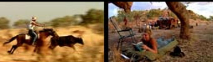
A RINGER'S LIFE – THE TOUGH LIFE OF KIMBERLEY RINGERS ON REMOTE CATTLE STATIONS, A WORLD OF DUST & DANGER.