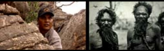
JANDAMARRA – THE STORY OF ABORIGINAL FOLK HERO, JANDAMARRA, WHOSE RESISTANCE TO PASTORALISTS AND THE POLICE RIVALLED THAT OF THE KELLY GANG IN VICTORIA.