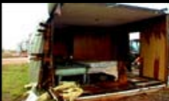
CYCLONE ALLEY – A STUDY OF THE COAST BETWEEN BROOME AND PORT HEDLAND, WHICH EXPERIENCES MORE CYCLONES THAN ANYWHERE ELSE IN THE WORLD.