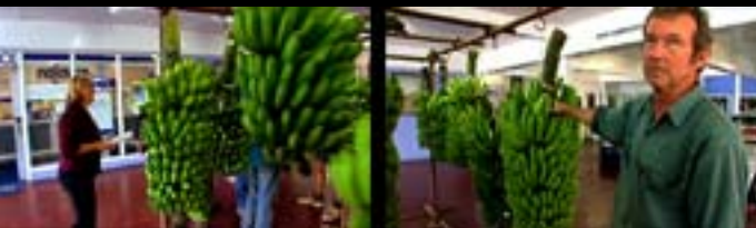
BIGGEST BANANA – BANANA GROWERS OF MURWILLUMBAH, NSW, GATHER TOGETHER FOR AN ANNUAL COMPETITION TO SEE WHO HAS GROWN THE YEAR'S BIGGEST BUNCH.