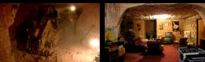
DOUG'S NEW DUGOUT – A GLIMPSE INTO THE WORLD OF THE MEN OF COOBER PEDY WHO MAKE THEIR HOMES UNDERGROUND.