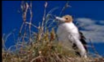
SMALL ISLAND, BIG HISTORY – THE STORY OF THE LACEPEDE ISLANDS, SMALL ATOLLS RISING OUT OF THE SEA NORTH OF BROOME, WHICH PROVOKED AN TERRITORIAL DISPUTE OVER THEIR ONCE-RICH SOURCE OF GUANO (PHOSPHATE FERTILIZER).