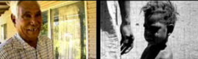
MEMORY VAULT – IN BROOME, AN INTERACTIVE COMPUTER ARCHIVE IS ESTABLISHED BY AN ORDER OF CATHOLIC NUNS AS A MEANS OF RECONCILING WITH THE DESCENDANTS OF THE 'STOLEN GENERATIONS'.