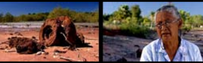
BROOME SHACKS – A HISTORICAL AND CONTEMPORARY TOUR OF THE SHACKS THAT DOTTED THE BROOME SHORELINE AT THE HEIGHT OF THE PEARL SHELL INDUSTRY.