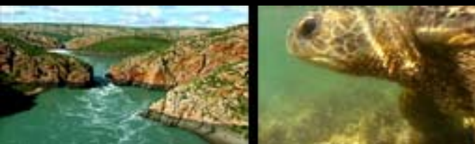
DISAPPEARING TRIBE – ONE OF AUSTRALIA'S GREATEST MYSTERIES IS REVEALED IN THE DISAPPEARANCE OF THE YAWIJIBAYA PEOPLE FROM HIGH CLIFFY ISLAND OFF THE KIMBERLEY COAST.